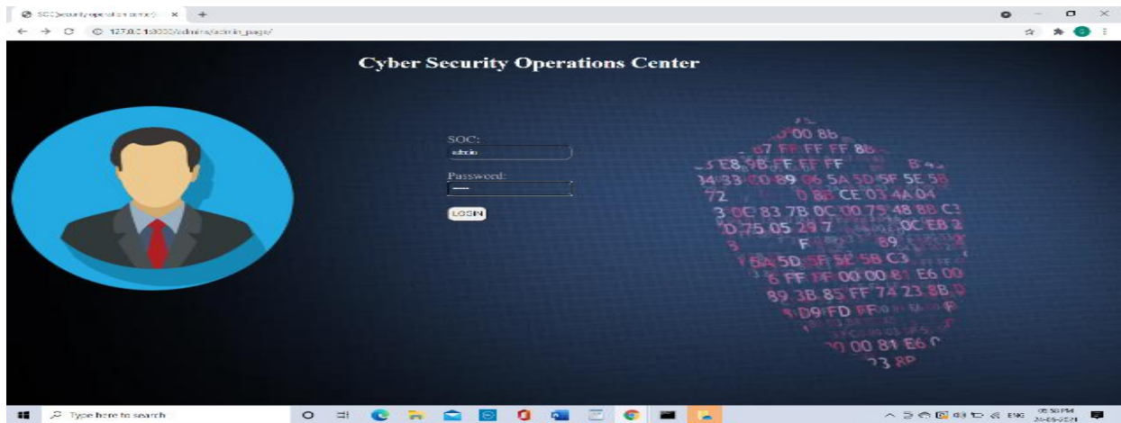
Fig 2: Login credentials for soc.