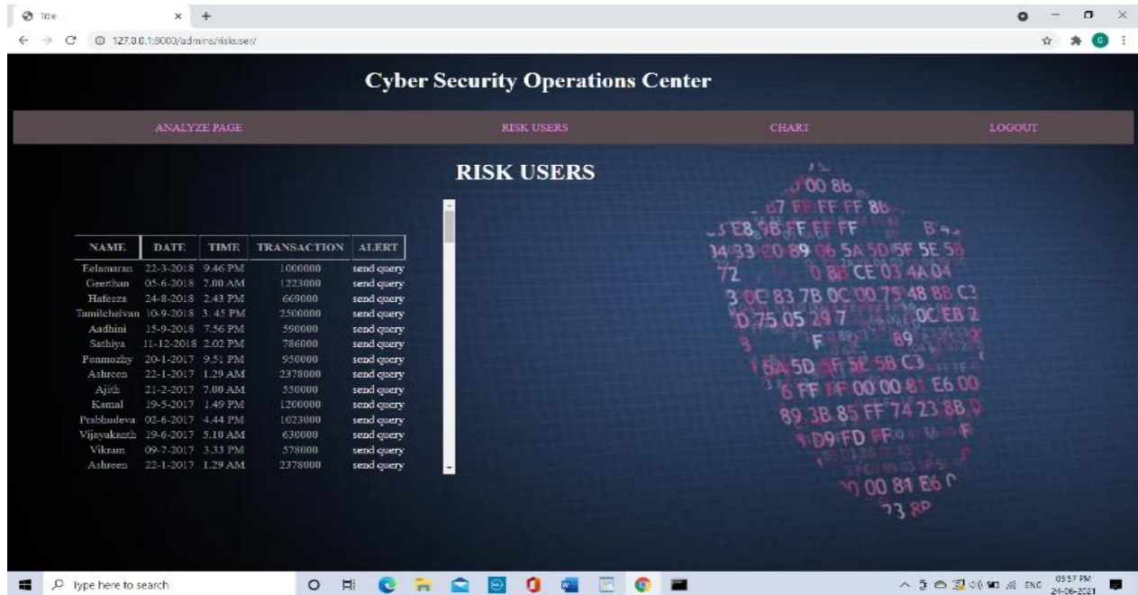
Fig 4: Risk user detecting and sending query.