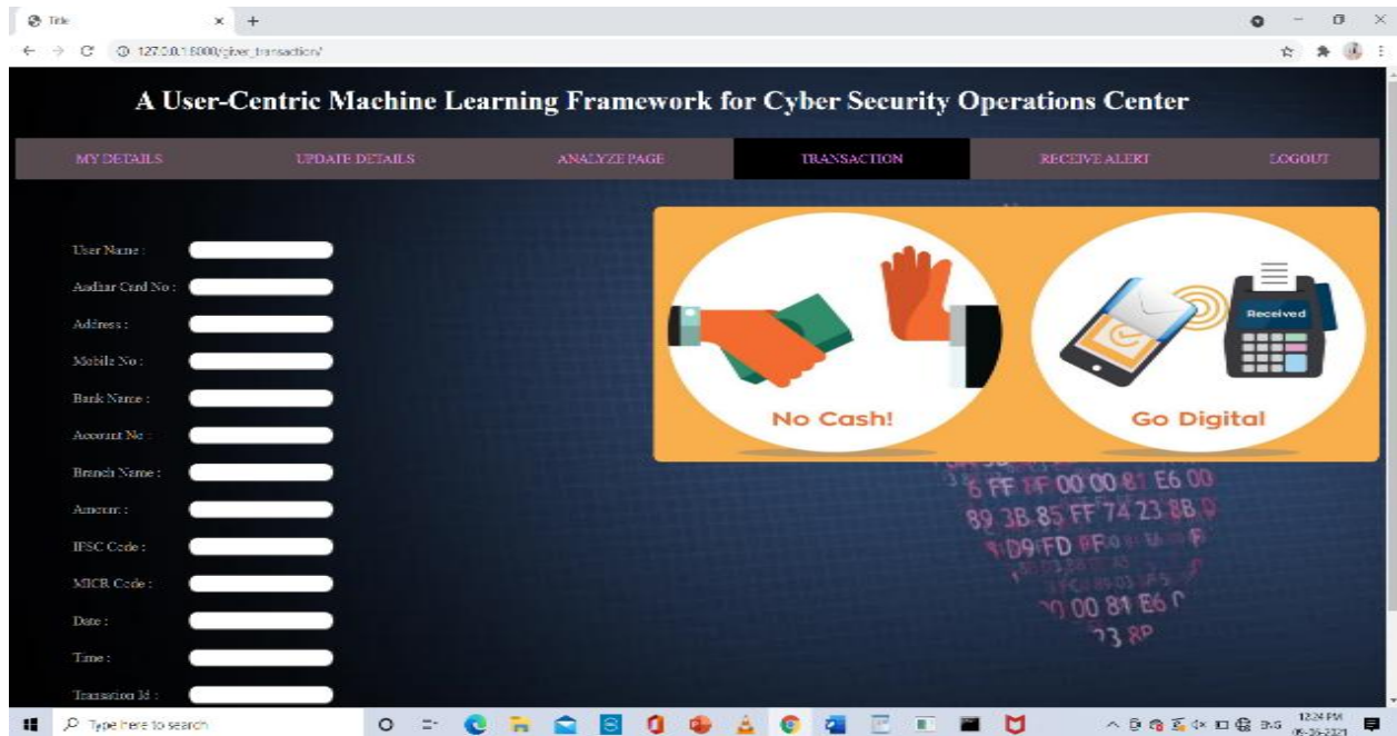
Fig 3: Transactions of the user.